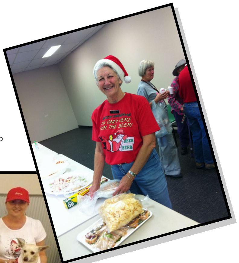
Tuesday Xmas break-up